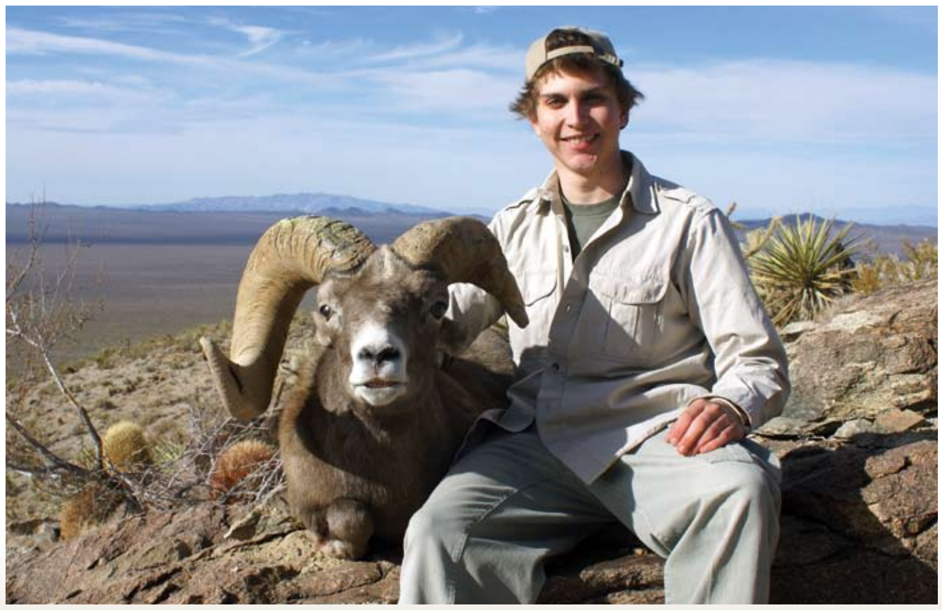
The author's desert sheep was an old ram with one broken horn; the other horn had great mass and measured 37 inches. It was the oldest ram shot in the state of California in 2009.

By that time it was around five in the afternoon, and the sun was beginning to set. We knew we didn't have enough daylight to go after the rams, so we decided to make our way back to camp.