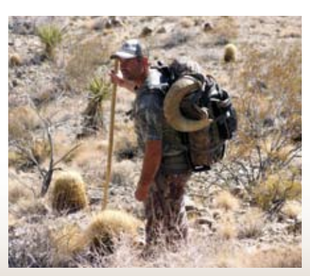
One of the guides packs out the ram.

The mountains, the sheep, and the guides provided me with one of the most memorable experiences I've ever had on a hunt. Never have I been on a more rewarding and fun adventure. Long before I ever went hunting for the first time, I always admired the trophies in my father's library. Among them is a collection of nice sheep heads, something I have always wished I, too, could get. Bagging this respectable old one-horned California desert ram finally put me on that path.