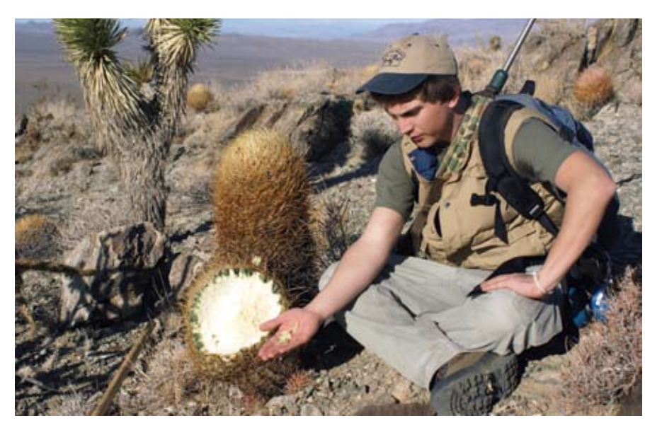
Desert sheep use their horns to break open cactus to get at the moisture inside.