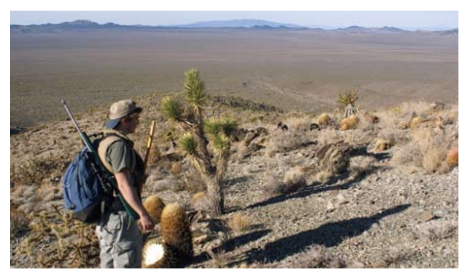
A hot day for hunting in the Clark-Kingston mountains of eastern California.