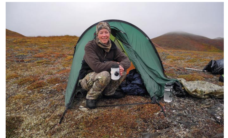
Weight is the limiting factor on a fly-in Alaska hunt, so camps aren't fancy. Each piece of gear you bring has to be carefully chosen if you hope to stay reasonably warm and dry.