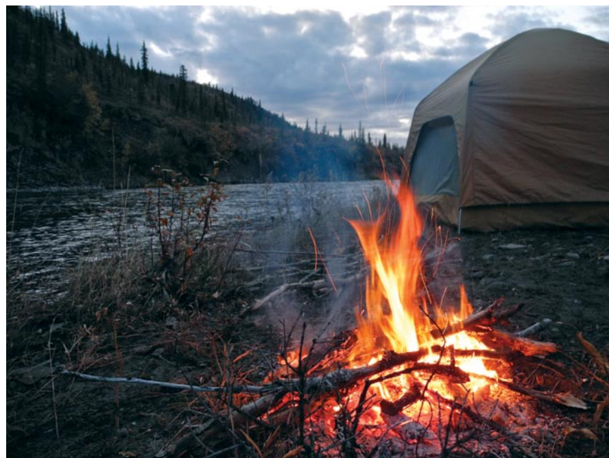
A riverside campfire on the last evening of the bear hunt.