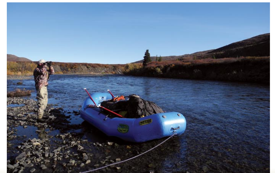
The hunters floated downstream in this inflatable raft, camping each night on the riverbanks.